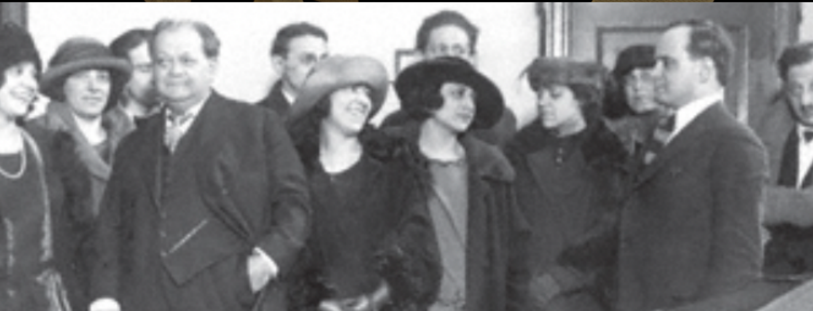
The original cast of God of Vengeance , 1923

Sholem Asch is a Polish-born novelist and playwright, the most controversial and one of the most widely known writers in modern Yiddish literature. He was born on November 1, 1880 and died July 10, 1957. One of the 10 surviving children of a poor family, Asch was educated at Kutno's Hebrew school. In 1899 he went to Warsaw, and in 1900 he published his highly praised first story—written, as was a cycle that followed, in Hebrew. On the advice of the Yiddish writer I.L. Peretz, he subsequently decided to write only in Yiddish, and with Dos Shtetl (1905; The Little Town , 1907) he began a career outstanding for both output and impact. His tales, novels, and plays filled 29 volumes in a collected Yiddish edition published in 1929–38.